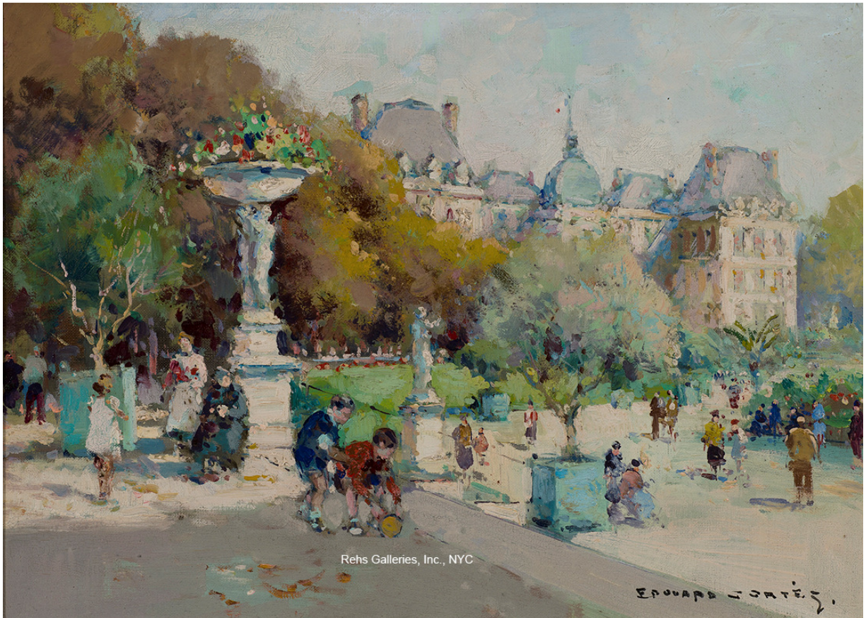
Edouard Leon Cortes Palais du Luxembourg, Paris