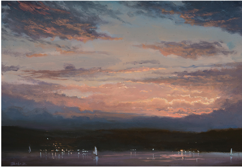
Ken Salaz Sunset Over Nyack – 6.30.16