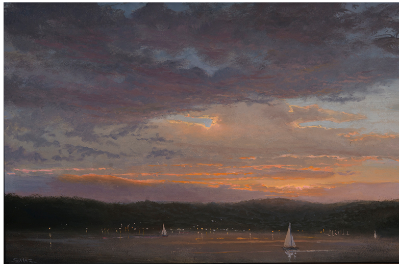
Ken Salaz Sunset Over Nyack – 7.7.16