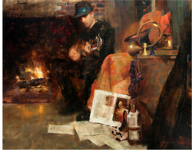
Katie Swatland Fire